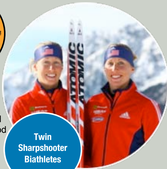
Twin Sharpshooter Biathletes